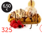
325 Banana waffle Allergens: 1,3,6,7,8