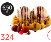
324 Som waffle Allergens: 1,3,6,7,8