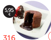
316 Chocolate souffle Allergens: 1,3,5,6,7,8,11