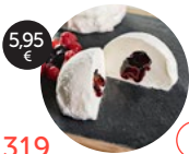
319 Cheesecake and berries mochi ice cream Allergens: 1,3,6,7,8,11