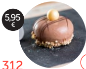
312 Round portion of milk caramel Allergens: 1,3,5,6,7,8