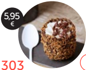
303 Baileys Allergens: 1,5,6,7,8,11