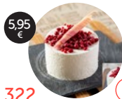
322 White chocolate with a red fruit centre Allergens: 1,3,6,7,8,11