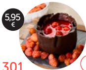
301 Wild strawberries Allergens: 3,6,7,8,11