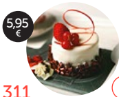
311 White chocolate and strawberry sacher Allergens: 1,3,5,6,7,8,11