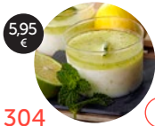
304 Frozen mojito Allergens: 1,3,6,7,8,11