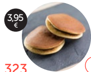
323 Chocolate dorayaki / 1 Pc. Allergens: 1,3,5,6,7,8,11