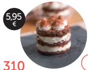
310 Tiramisu Allergens: 1,3,5,7,8,11